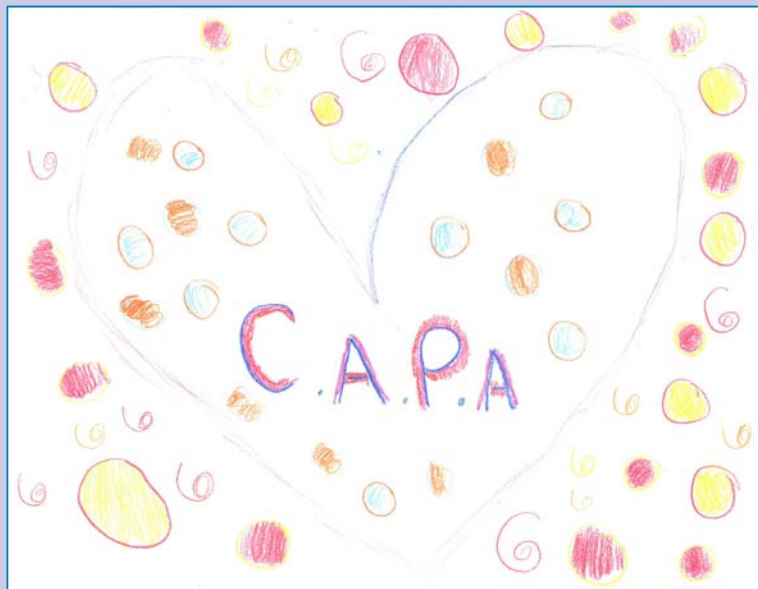
Art by shelter resident, age 7

In 2014, the Open Arms Shelter welcomed 69 children, bringing us to 2,158 children served since opening in 1985. CAPA provided a total of 4,632 days of care and averaged 12.69 residents per day.