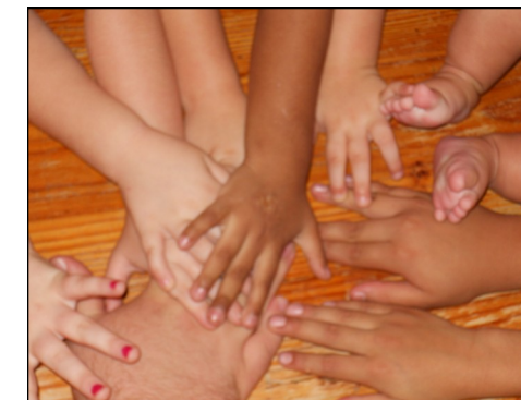
Pictured above: Hands and feet of current residents of CAPA's Open Arms Shelter (ranging in age from 4 months to 18 years). The current average number of children per night is 10.