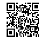
Scan this QR code with your smart phone to learn more about the Auction!

Charity Auction & Party An Evening of HOPE for the Children Saturday, November 19 The Shed (Port Royal) Doors open at 6:00 pm $10 per person